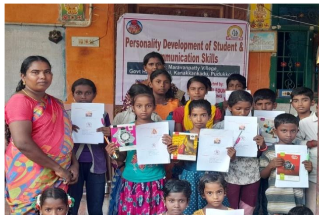
The students are showing the Career booklet and Educational materials